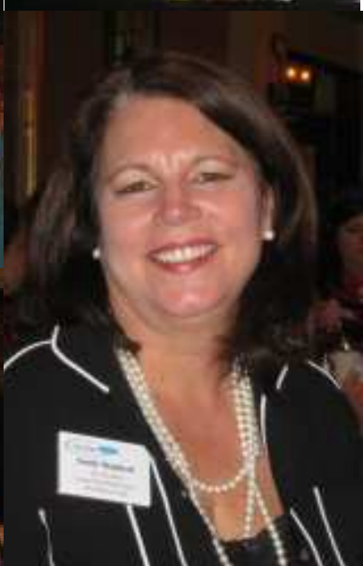
WCR January Meeting